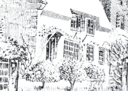
Hackleton Meeting House, where the young William Carey worshipped

so that the crowds who gathered might hear. Looking at Fuller from the yard as he preached, was the young William Carey.